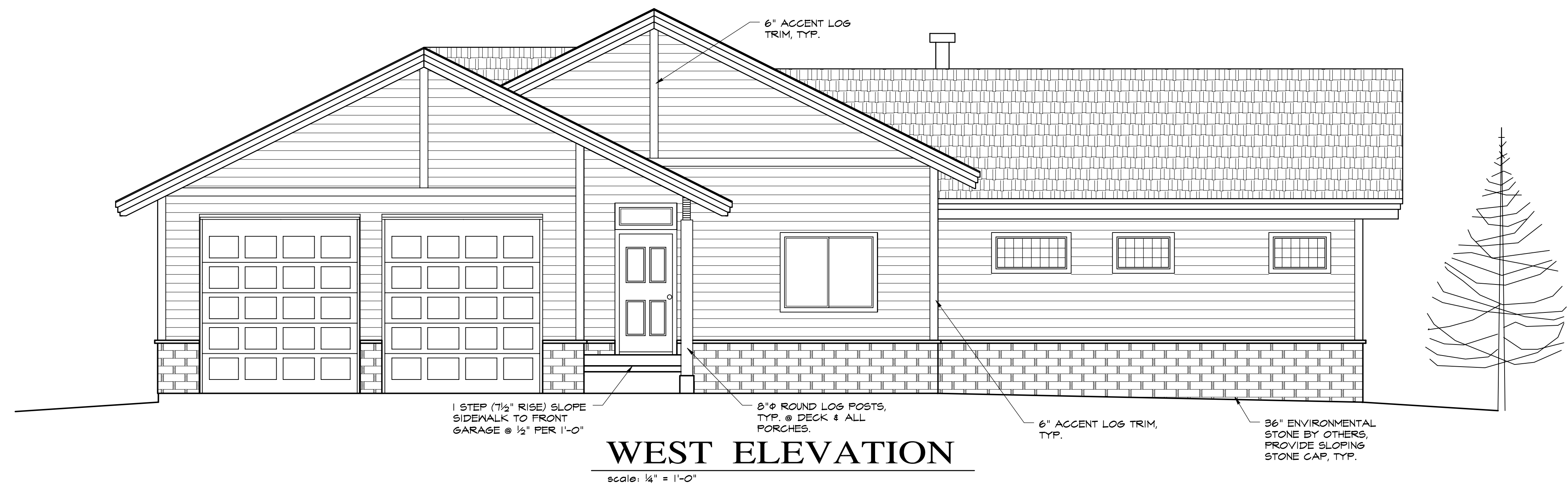
WEST ELEVATION scale: 1/4" = 1'-0"